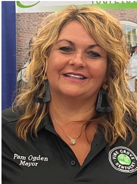
Mayor Pam Ogden